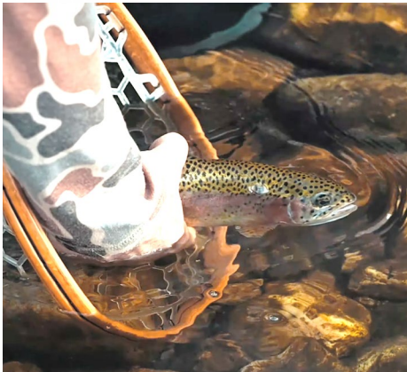
Careful handling leads to survival

https://www.youtube.com/watch?v=SMGO50R_IrA